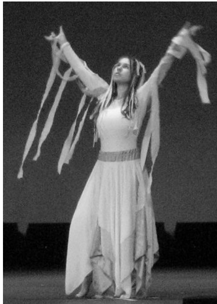
The Artifact—Masquerade Entry