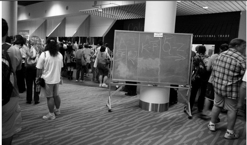
Fans Line Up (Alphabetically) to Register at Denvention

notebook, with a description of the available items, and bid sheets will be at the Information Desk at the CCC. The Auction will close 10pm Saturday and results will be announced in the Sunday newsletter.