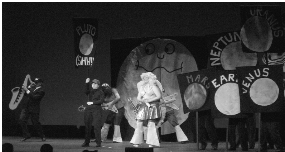
"Schoolhouse Rock Presents"